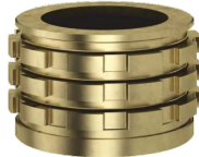
Female insert Rp 1/2" Technik