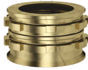
Female insert Rp 1/2" Standard