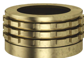
Female insert Rp 1" Standard