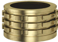
Female insert Rp 3/4" Technik