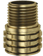
Male insert R 1/2" Technik