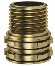
Male insert R 1/2" Standard