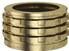
Female insert Rp 1" Standard