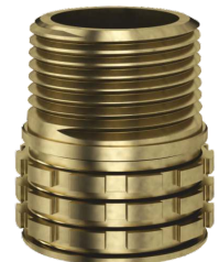
Male insert R 3/4" Technik